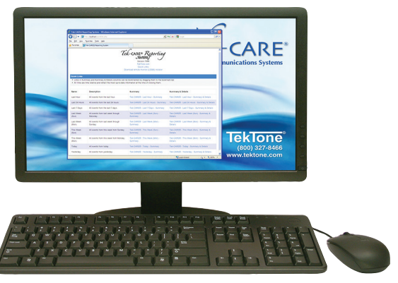
Tek-MMARS®300 Management Monitoring And Reporting System