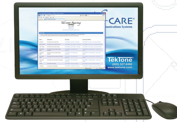
Tek-MMARS®300 Management Monitoring And Reporting System.

Integrate a variety of systems together by adding software modules to the Tek-MMARS®300. The Tek-MMARS®300 can display and report on calls and events from any modern TekTone® nurse call system — plus a variety of other systems, such as fire and security systems.