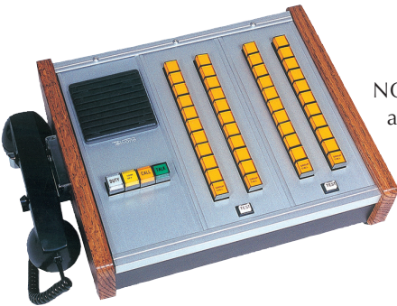
NC200 audio-visual master station

Tek-CARE® NC110 nurse call system provides audible and visual call indication without intercom communications. The NC110 master annunciator station has lights for each remote station, may be used as a remote annunciator for NC200 and NC150 systems, and may be wall- or desk-mounted. The small, desk-mounted NC110A master annunciator has LEDs for each remote station, and is water-resistant.