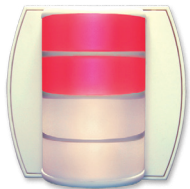
LED corridor light