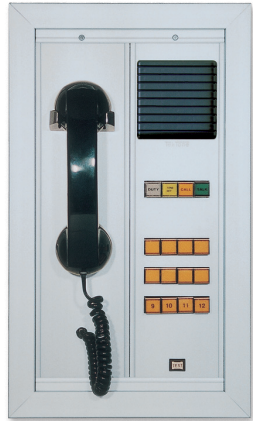
NC150 audio-visual master station

Tek-CARE® NC200 and NC150 are audio-visual nurse call systems that provide two-way communications with residents and patients. The direct-select master stations have lighted buttons for each remote station, and include the Staff Follow function for increased staff mobility. The desk-mounted NC200 also includes 10-station Group Call, enabling paging through the nurse call system. The NC150 may be wall- or desk-mounted.