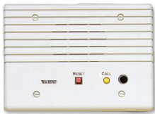
single bed stations with audio

Tek-CARE® NC110 nurse call system provides audible and visual call indication without intercom communications. The NC110 master annunciator station has lights for each remote station, may be used as a remote annunciator for NC200 and NC150 systems, and may be wall- or desk-mounted. The small, desk-mounted NC110A master annunciator has LEDs for each remote station, and is water-resistant.