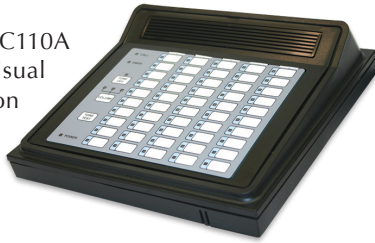
NC110A audible-visual master station